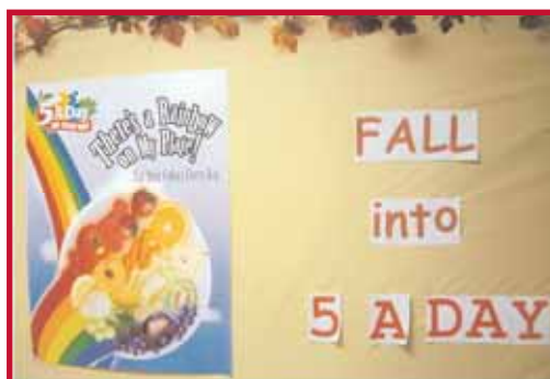
COFFEE COUNTY'S 5 A Day Bulletin Board

Coffee and Pike County Staff made gift baskets for the OB and Pediatric Offices for Breastfeeding Awareness Month to show the doctors and their staff that WIC supports breastfeeding.