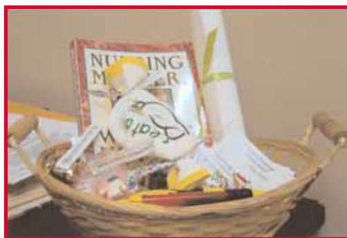
PIKE COUNTY Staff Made Gift Baskets