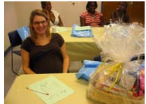
Baby Shower Attendees