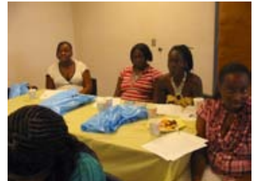
Baby Shower Attendees