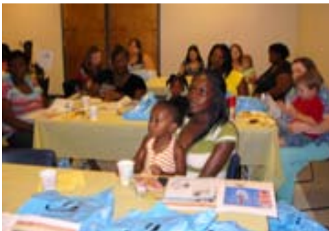
Baby Shower Attendees