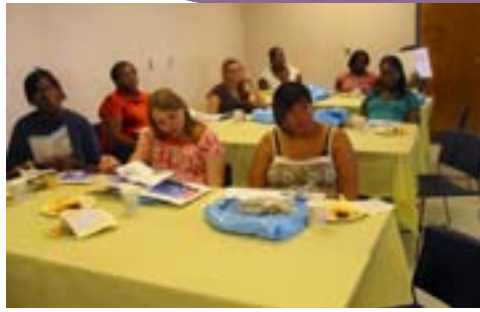
Baby Shower Attendees