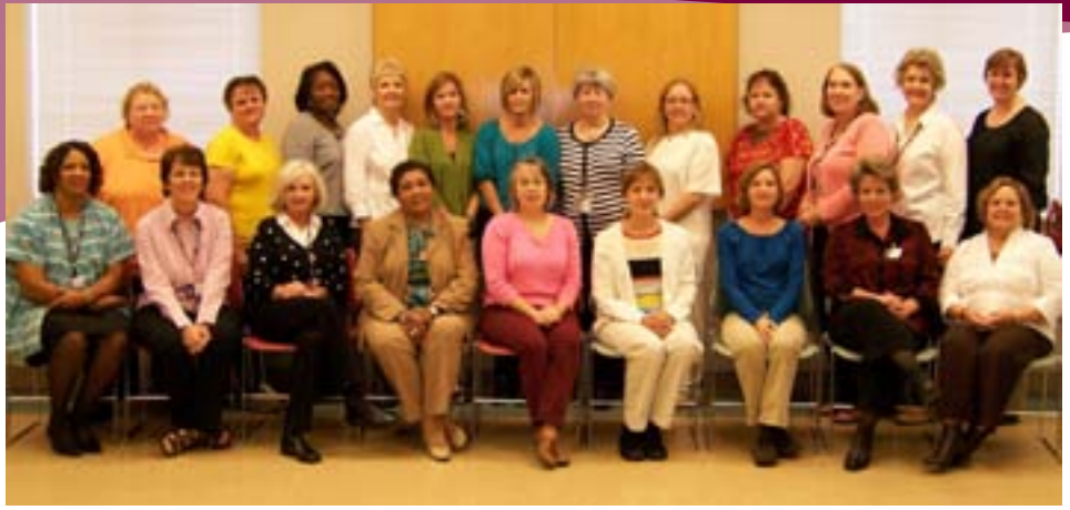
Area 7 & 9 WIC Coordinators and Nutrition Staff met recently to receive program updates.

WIC Toll-free Number 1-888-WIC-HOPE 1-888-942-4673