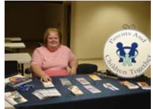
The PACT table and one of their employees