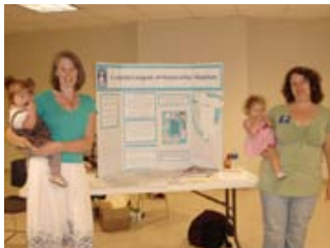
Team leaders from the La Leche League in Huntsville