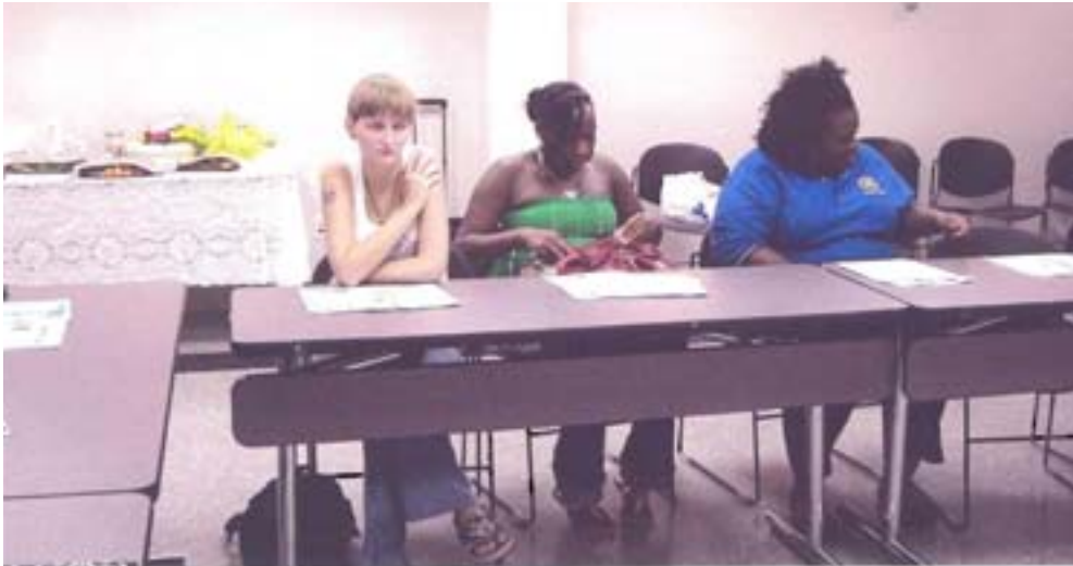
Breastfeeding Class Attendees