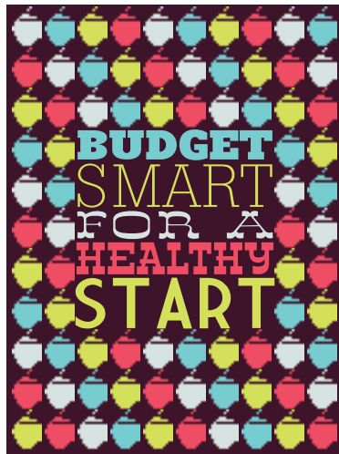
WIC Outreach Postcard

In May 2009, the State Office began working with the Alabama Department of Public Health's Social Marketing Division to design new outreach materials. Postcards were created for clinics to distribute