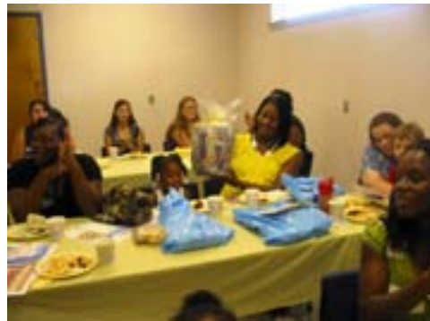
Baby Shower Attendees