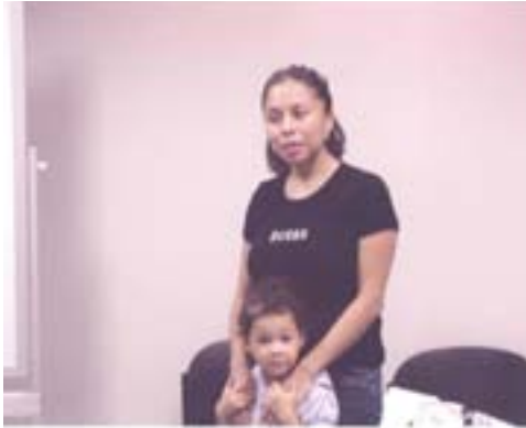
Breastfeeding Class Attendees