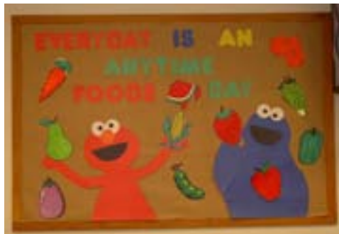
Houston County Bulletin Board in lobby.