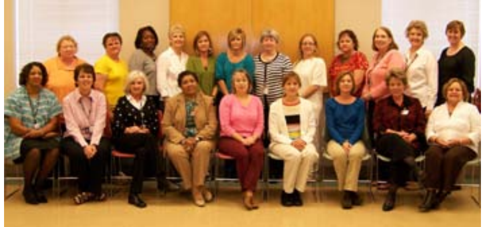
Area 7 & 9 WIC Coordinators and Nutrition Staff met recently to receive program updates.

In early 2010, the Hale County Health Department plans to open a new WIC site in Moundville, AL. The Moundville United Methodist Church has agreed to allow WIC use of their Family Life Center to see clients. This satellite clinic will provide easier access to WIC services in northern Hale County. The initial plan is to offer WIC services one day a month.