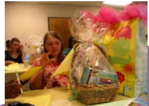
Baby Shower Attendees