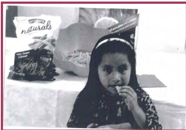
Lister Hill WIC participant at promotion for Fruit and Veggies: More Matters