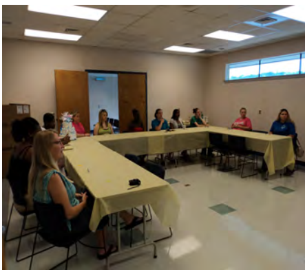
WIC participants in attendance at Breastfeeding baby shower