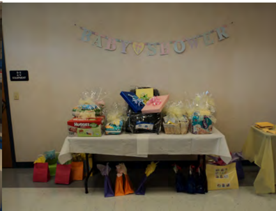
Table with Breastfeeding gifts for give away