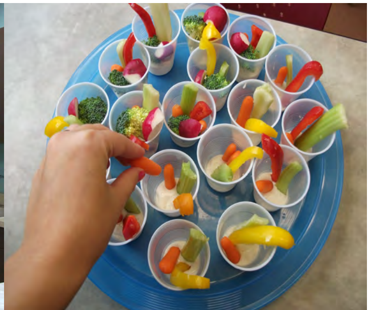
Fresh vegetable cups with salad dressing.

Some of the other Area 2 counties set up breast pump demonstrations, provided refreshments, and gave away door prizes. Incentive items provided by WIC were also distributed and, most important of all, education, printed information, and encouragement for breastfeeding moms was freely disseminated.