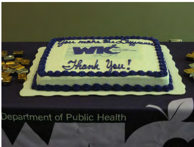
Area 4 cake with theme and thank you