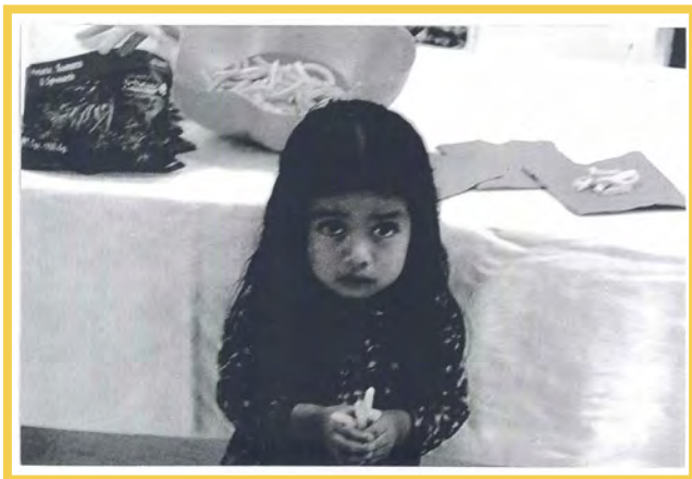
Lister Hill WIC participant at promotion for Fruit and Veggies: More Matters

Lister Hill Health Center celebrated Fruit and Veggies: More Matters month by participating in the following promotional activities. Each participant received one or two of the following: Pamphlets - "Munching Matters-the secret to Smart Snacking" and "Fruit and Veggies--T.A.S.T.E. Guide" and/or Bookmarks - "Think Sweet...Sweet Potatoes are Super" and "Fruit and vegetables will take you above and beyond!" They also provided colorful veggie snacks. The snack included potatoes, tomatoes, and spinach.