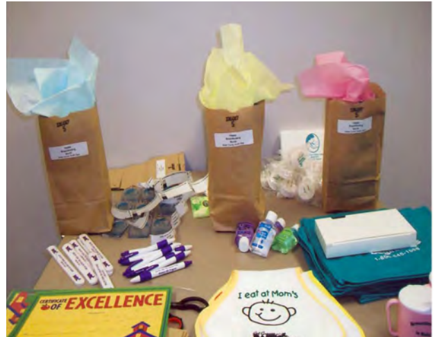
Display table with Breastfeeding-A 3D Experience campaign goodie bags