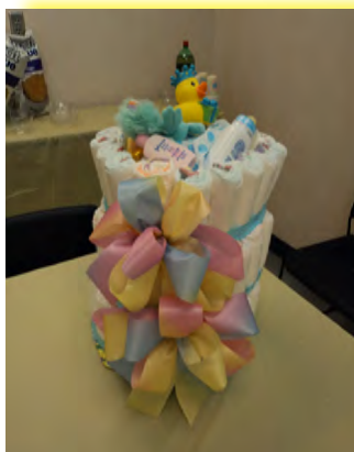
Bibb County baby shower goodies/gift