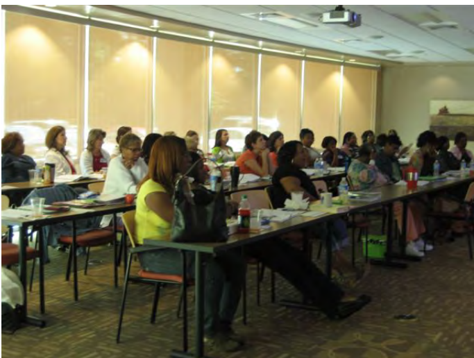
Area 4 staff meeting/training