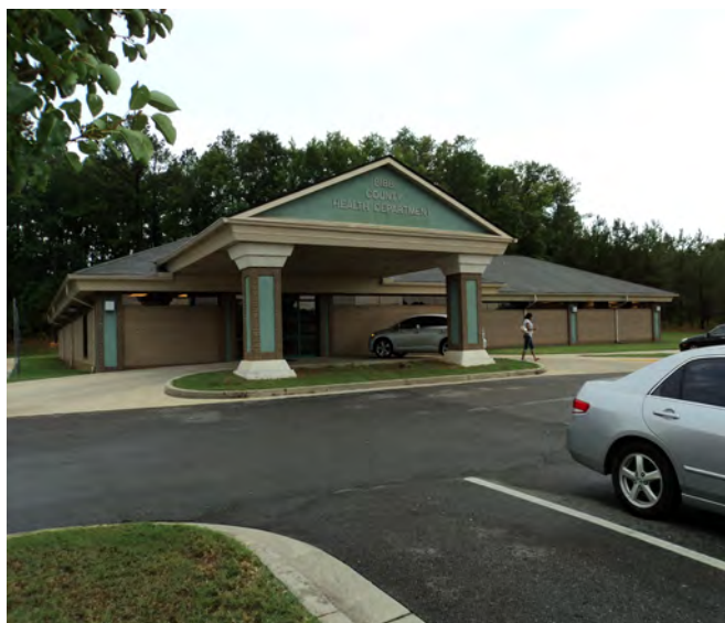
Bibb County Health Department