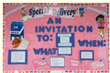
Houston County Baby Bonanza Bulletin Board

This proved to be very informative and provided for some great interaction. They also invited a Lactation Counselor from Southeast Alabama Medical Center (SAMC) to answer any questions and give advice. A total of six people were in attendance with two of those being dads. The participants were very eager to learn and asked several questions. Two of the women that were not planning to breastfeed when they arrived decided to at least try breastfeeding by the end of the session. Each participant received a gift bag before leaving which contained a few items to show appreciation for their attendance and participation. It is safe to say that Baby Bonanza is off to a great start!