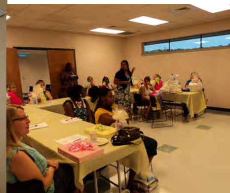
WIC participants in attendance at Breastfeeding baby shower