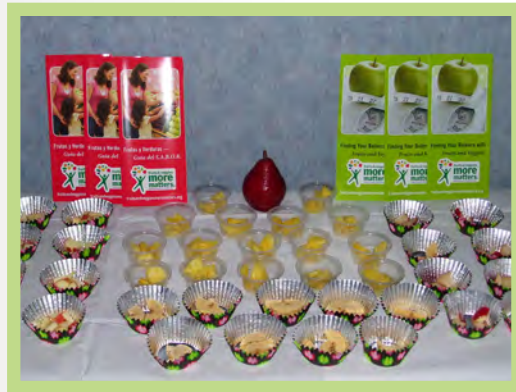
Fresh fruit tasting event table - Jackson County

Jackson County WIC participants were treated to a fresh fruit tasting event to celebrate “Fruits and Veggies--More Matters” month in September 2011. Fresh fruits such as plantains, pineapples, red pears and red apples were included. Cutting mats and brochures entitled “Finding Your Balance with Fruits and Veggies” were also provided.