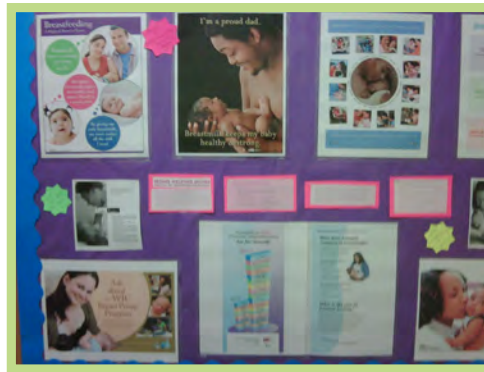
Calhoun/Anniston breastfeeding bulletin board designed by Peer Counselor

Calhoun County's Breastfeeding Peer Counselor designed a bulletin board for the Anniston clinic.