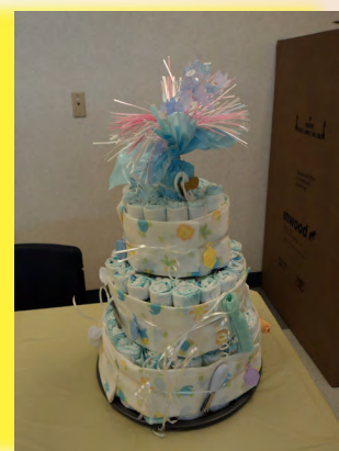
Bibb County baby shower goodies/gift