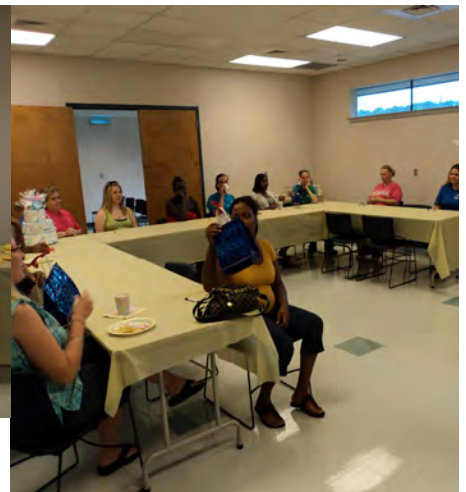
WIC participants in attendance at Breastfeeding baby shower