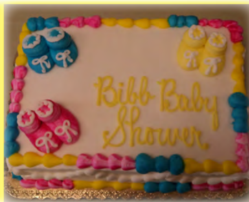
Bibb County baby shower cake