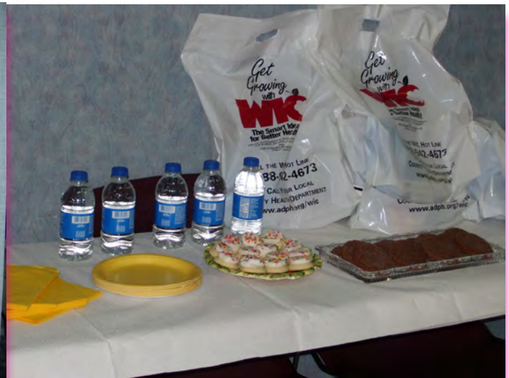
Table with refreshments and goodie bags for breastfeeding event in Jackson County.