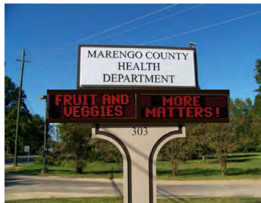
Fruits and Vegetables - More Matters campaign message displayed on Marengo County's electronic sign

Marengo County Health Department displayed a “Fruits and Vegetables - More Matters” sign on the electronic display board to bring awareness of the campaign and the importance of eating healthier to the community.