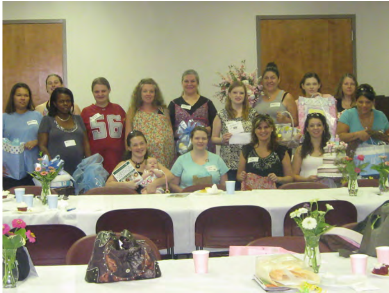
Expectant moms planning to breastfeed and fully breastfeeding moms at shower.

The Colbert County Health Department hosted a baby shower for expectant moms planning to breastfeed and moms who were fully breastfeeding during Breastfeeding Awareness Month, August 2011. Refreshments were served and door prizes were given away. The shower was a great success and enjoyed by all!