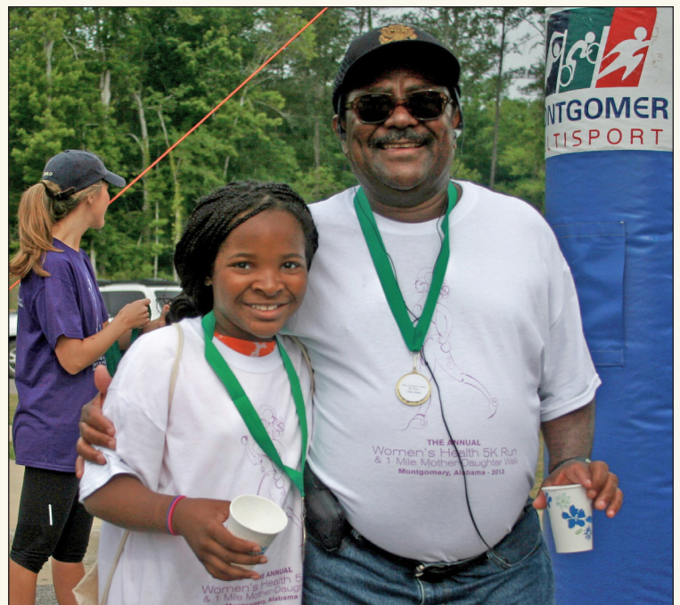
A grandfather joins his granddaughter in the 5K.