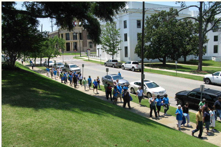
The event was designed to encourage walking during the work day as part of a health and fitness routine.

Hundreds of walkers participated in the Alabama Employee Health and Fitness Day Walk on May 18. Gov. Robert Bentley addressed participants, and health and wellness vendors provided information. The Nutrition and Physical Activity Division, the Governor’s Commission on Physical Fitness, and the Alabama State Employees Insurance Board were sponsors.