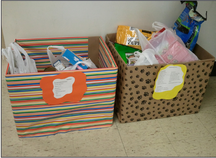
Bureau of Clinical Laboratories staff members collected donations of food for the Montgomery Area Food Bank and pet supplies for a local humane society. A blood drive was also conducted onsite on April 25.