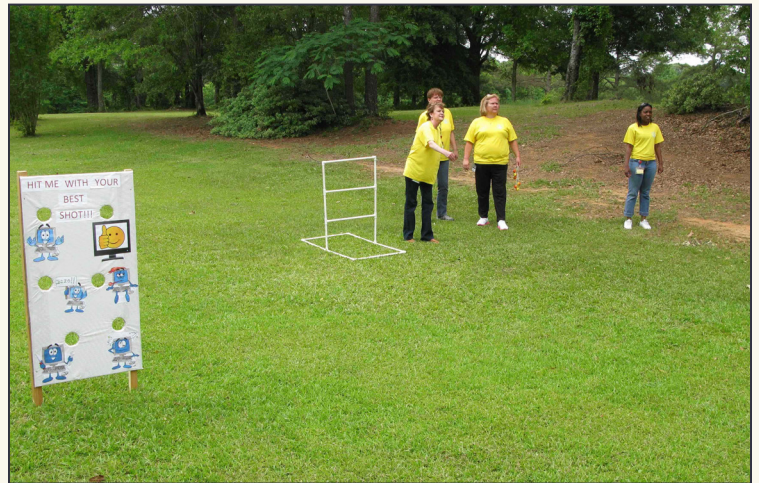
Spirited and fun events for National Clinical Laboratory Professionals Week included field games on Friday, and a guessing game where photos of employees' noses were displayed and staff guessed the identities of the people to match the noses. Special days included Team Colors Day, Wacky Tacky Wednesday and Hat Day.