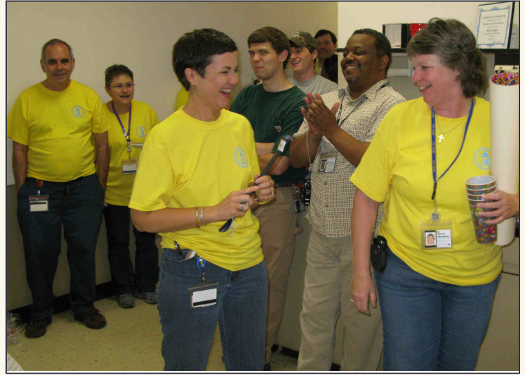
Door prize drawings, such as this one in which an Auburn University back-scratcher was won, added to the fun.