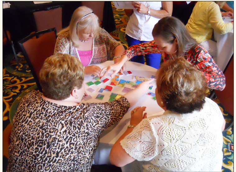
Training participants engage in the Public Health Area 9 QI Team Teach-Back session about building effective teams.