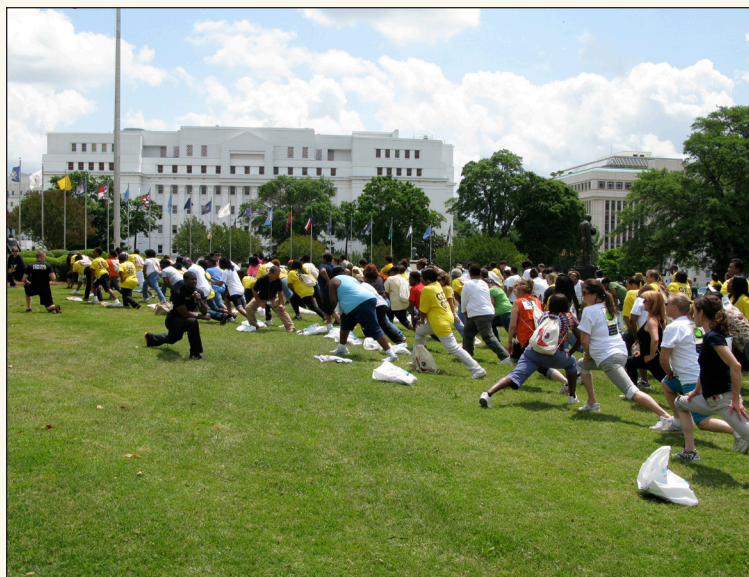
A stirring set of warm-up exercises set to music helped get participants ready for the walk.

The Annual Alabama Employee Health and Fitness Day held May 17 at the State Capitol once again was a success. The noncompetitive and free event is designed