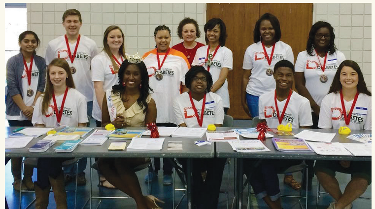
Jefferson County students promote diabetes awareness.