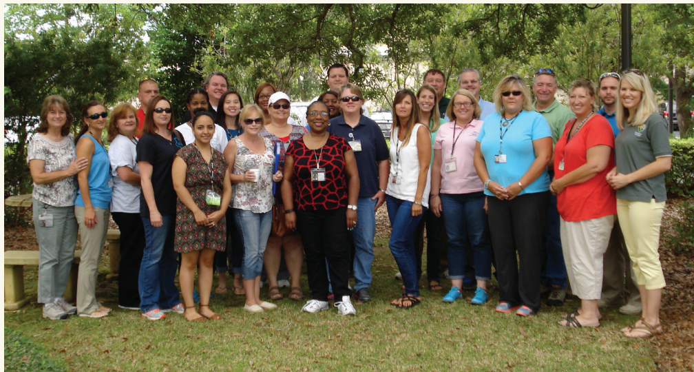
Some of the team members who participated in the CASPER based in Gulf Shores in June gathered for this group photograph.