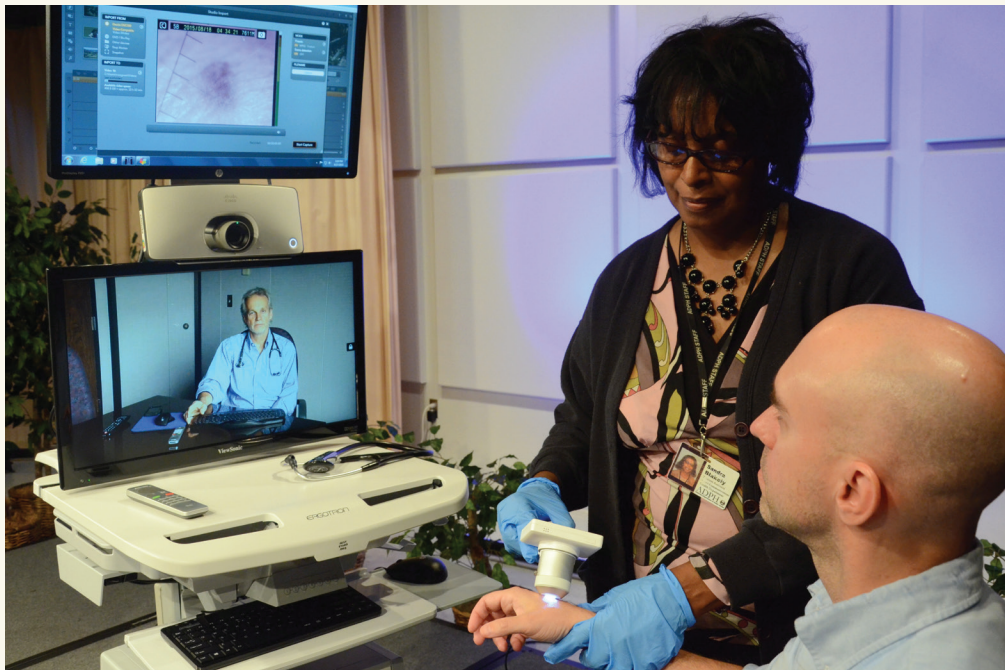
The dermatology lens for the handheld exam camera is able to provide magnification to allow the physician at the remote location to examine moles, lesions and other growths. This image is transmitted as seen on the top screen.

Increasing use of telemedicine is a key goal in Alabama's Community