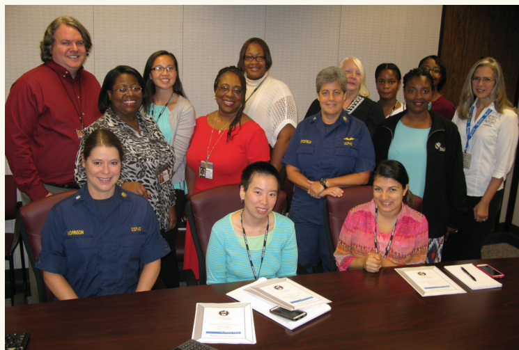
ClubEpi has met regularly since April 2010. Some of the members attending the Aug. 13 meeting in the RSA Tower are shown here.

ClubEpi members are involved in several workforce development efforts, including the development of a data skills and training needs assessment. Additionally, ClubEpi members actively participate in public health emergency preparedness and response activities