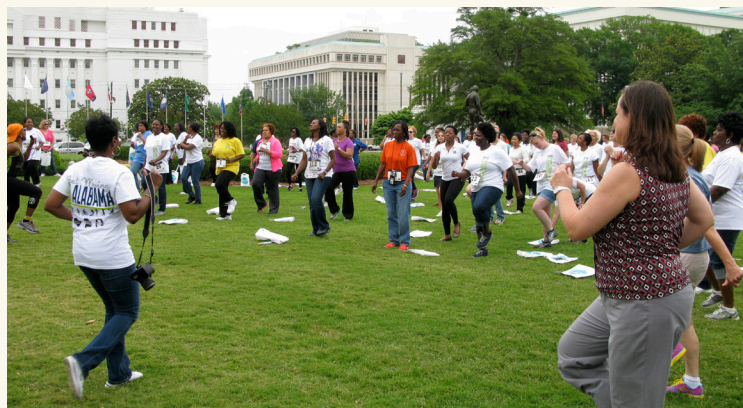
Spirited warm-ups on the Capitol lawn preceded the fitness walk.