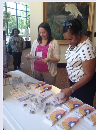
Participants review newborn screening resources during the 23rd USA Obstetrics and Gynecology Conference in Daphne, Alabama.

We are in the process of developing a single brochure that will replace all of the newborn screening brochures including the new booklet, "Definitions for 31 Core Conditions." Be on the lookout for this new brochure!