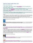
Family History Quiz