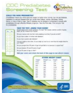
CDC Prediabetes Screening Test

American Diabetes Association Alert Day is the fourth Tuesday in March. The American Diabetes Association Alert Day is a one-day, "wake-up call" asking American public to take the Diabetes Risk Tests for developing Type 2 Diabetes. The tests are the Centers for Disease Control and Prevention (CDC) " CDC Prediabetes Screening Test " and " Take the Family Health History Quiz. " The American Diabetes Association's (ADA) test is " Are You At Risk For TYPE 2 DIABETES? Diabetes Risk Test. "