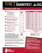
Are You At Risk for TYPE 2 DIABETES?