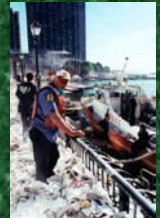
NYFD MARINE UNIT SKIPPER 2001 FDNY PHOTO UNIT