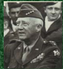
GEN GEORGE PATTON

“Plans are Nothing, Planning is Everything.” - Gen. George Patton