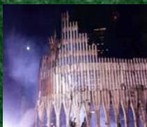
STILL STANDING WITH OUR SPIRITS 2001