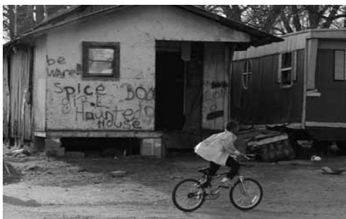
Black Belt, Alabama